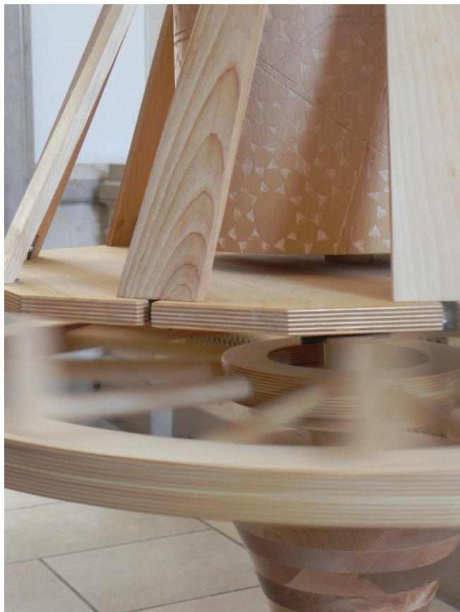
The Choice Spinner (Detail) Harwood, softwood, plywood and metal brackets and pins 28w x 28d x 64h inches 2012